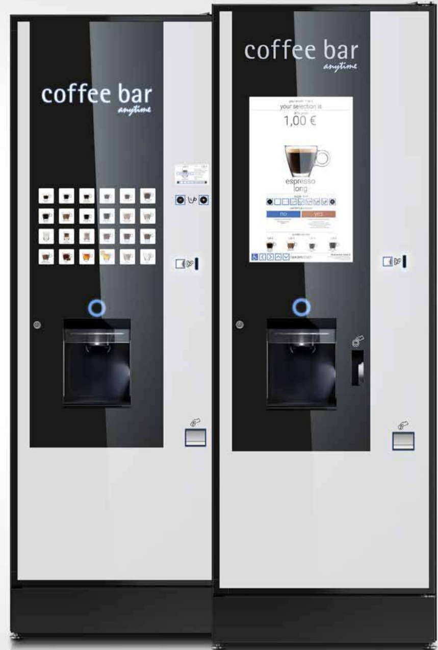
The luce zero.1 and luce zero.touch